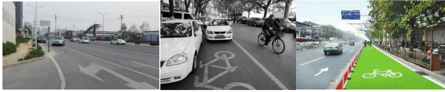
No Bicycle Lanes Non-standard Bicycle Lanes Standard Bicycle lanes